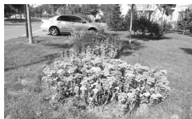
Fig. 1 Community greenway of Oriental Sun City in Beijing, China

In recent years, with the increasing attention to urban stormwater problems, research and applications on greenways combined with stormwater management are constantly emerging in China. Beijing University of Civil Engineering and Architecture designed the community greenway of Oriental Sun City in Beijing, and designed 23 green streets combined with the LID concept in the Guangming New District of Shenzhen [13] . Furthermore, in Dalian Eco-city Stormwater Control and Utilization Plan, one of the most important contents is using greenways to control runoff from streets, reducing pollutants and improving the present drainage standards. The community greenway of Oriental Sun City is shown in Fig. 1.