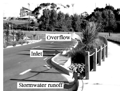
Fig. 3 Relationship between runoff and stormwater facilities

ceeds the maximum capacity of stormwater facilities. There are two major overflow ways: one is through stormwater facilities incision overflowing back to the greenway, and then entering other stormwater facilities or stormwater sewers; the other is setting overflow outlets inside the stormwater facility, excessive stormwater directly overflowing into the municipal pipe network. Fig. 3 shows an example of green street stormwater management measures in New Zealand.