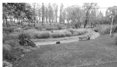
Fig. 2 Waterfront greenway in Shanghai Houtan Park

In the transformation of Yongning River waterfront green belt in Taizhou, Zhejiang, the designers of Turen-scape combined waterfront greenway with flood control, wetland purification, recreation and so on. The Houtan Park of the Shanghai World Expo Garden used the waterfront greenway to construct a wetland system, which purified water quality, improved the micro climate, and beautified the environment [14] . Fig. 2 shows the waterfront greenway in the Houtan Park, Shanghai.